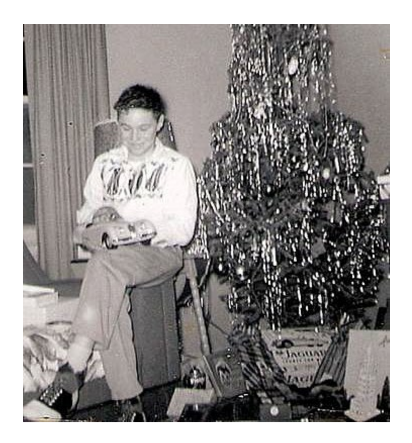
I was about 10 or 11, I guess.

Merry Christmas, everyone. Please don't forget the reason for the season.