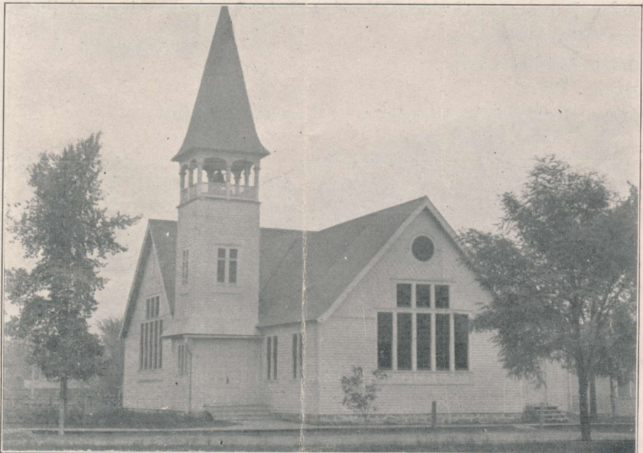
"UNION CHURCH" Built 1889

Sunday School, morning and evening services and Young People's meeting next Sunday at the same hours as today.