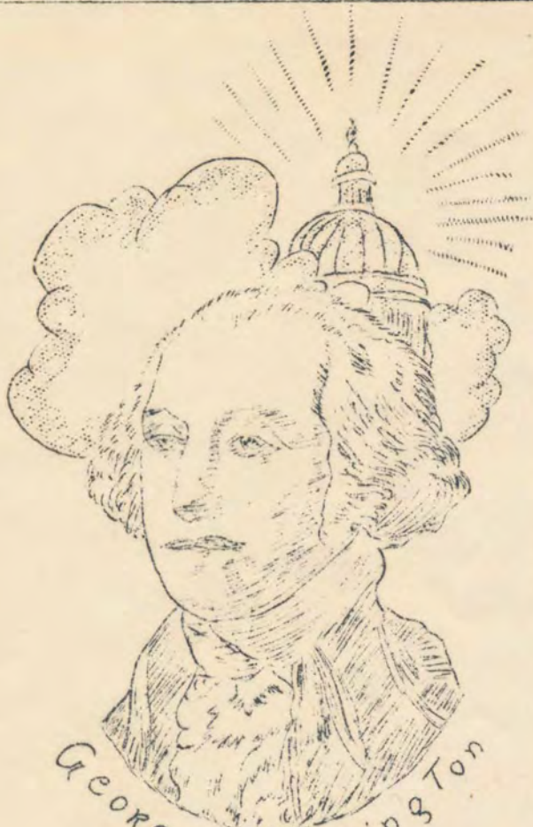
George Washington 1st president Born Feb. 22, 1732

"First in war, first in peace, and first in the hearts of his countrymen."