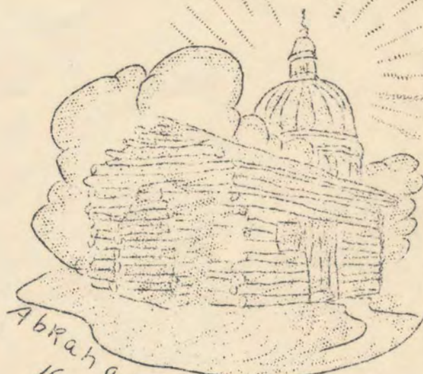
Abraham Lincoln 16th president Born Feb. 12, 1809