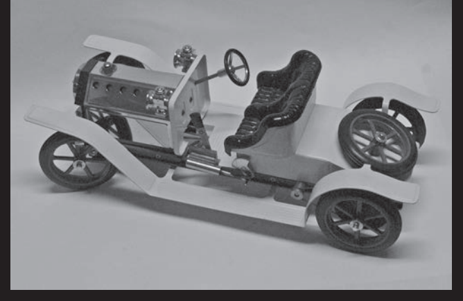
on display June 3-10 at the South Wood County Historical Museum. The museum is open from 1-4 p.m. Sundays and Tuesdays.