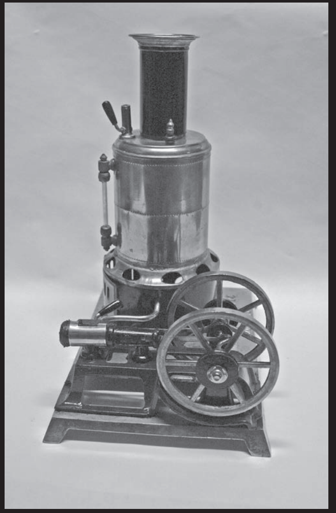
From Marshall's collection. Top left: Steam powered both miniature and full-size automobiles. Left above: Weeden classic engine from turn of century. A slide valve admits steam to the cylinder. Right: Vertical boiler with two flywheels. Facing page: Sterling hot air engine didn't use steam.