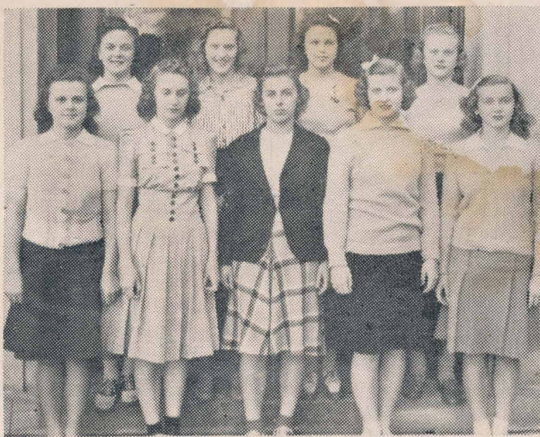
THE HOMECOMING QUEEN AND CANDIDATES

Again we welcome the Alumni to our festivities for Homecoming and hope they will enjoy themselves.